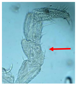
7<sup>th</sup> pereopod of male T. sarsi showing hooked process on merus.

During February 2016, a brief opportunity was taken to investigate a churchyard on limestone in Great Longstone in the Derbyshire Peak District. Four Trichoniscoides specimens were found under stones around the edge of the graveyard. These were all cream coloured and clearly infused with orange-pink, with eyes of a single red ocellus. Three were female, but one male specimen was also present. Unfortunately, this specimen rapidly died and dried up in the collecting tube, which made dissection and examination difficult. However the 7th pereopods did not show the hooked spine on the merus and the long tapering shape of endopod 2 was much more like that of Trichoniscoides saeroeensis. In addition, the form of exopod 2 also suggested Trichoniscoides saeroeensis. A return visit a week later, revealed a further 6 female specimens and two males. The latter clearly showed the process on the merus and dissection confirmed the more usual endopod structures for Trichoniscoides sarsi. There is a single female record for Trichoniscoides sarsi/helveticus agg. in Derbyshire, but the Great Longstone specimens are the first confirmed Trichoniscoides sarsi for the county. The inconclusive potential saeroeensis remains dubious, due to this species' very coastal distribution. However, the original report of