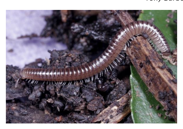
Cylindroiulus appeninorum (photo by Paul Richards).