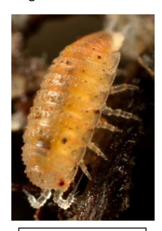
Female T. sarsi.

In addition to these records of the orange-pink Trichoniscoides species, two new sites have also recently been located for the slightly larger and darker, Trichoniscoides albidus . Derek Whiteley found specimens at two riverside sites in Farndon, near Newark during January 2016. These represent the first records for Nottinghamshire.