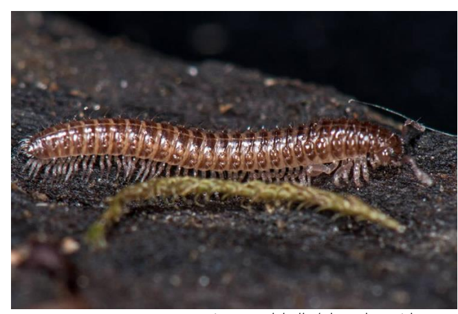
Anamastigona pulchella