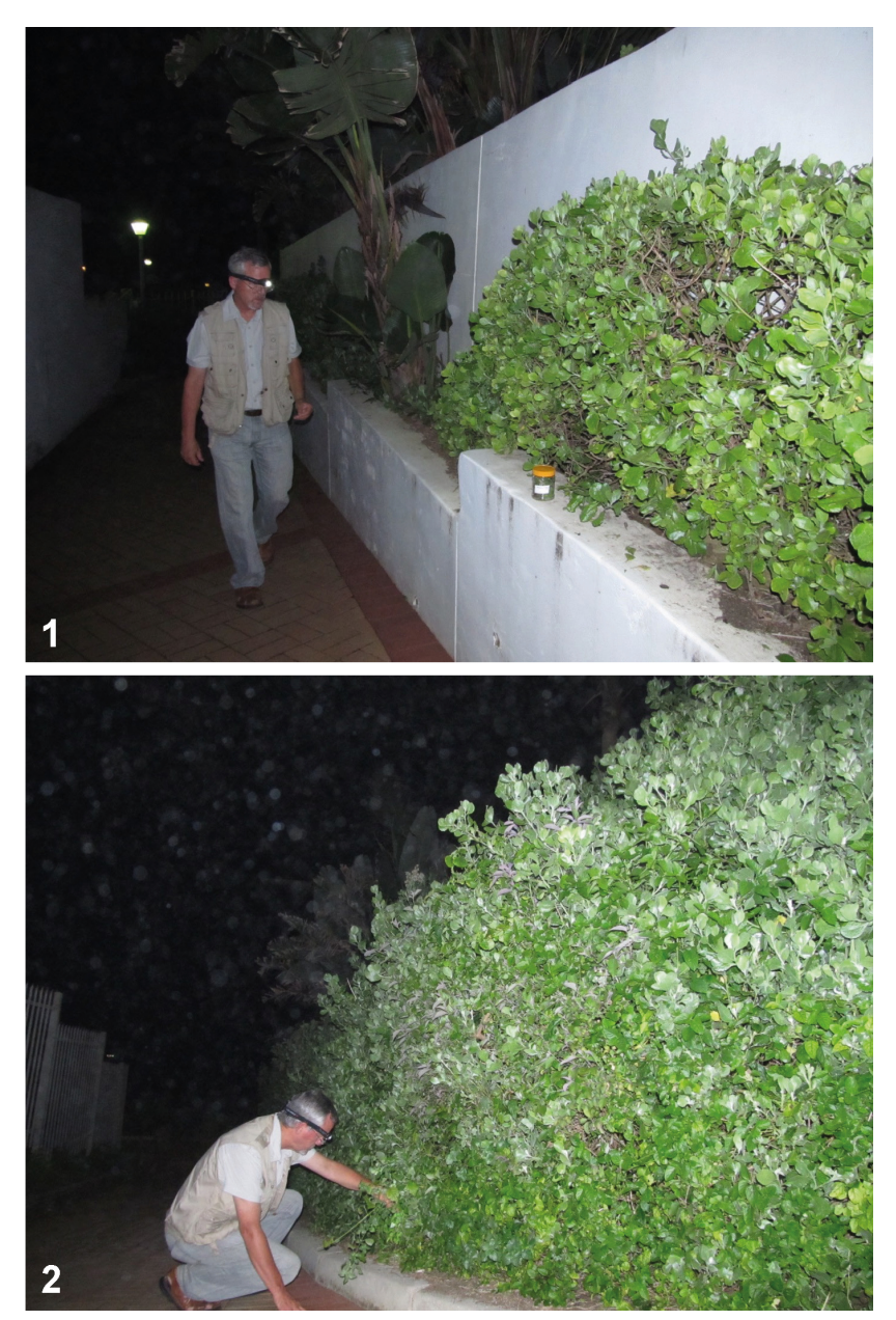
Figs 1, 2. Photographs at night of senior author D.S. Glazier near rows of bietou bushes Chrysanthemoides monilifera rotundata along walkways near The Promenade of Umhlanga beach, South Africa. These are two of the sites where numerous individuals of the isopod Tylos capensis were observed climbing on bietou bushes.

edges), whereas those from Yzerfontein were thicker (more succulent) and more smoothly rounded, thus more closely matching those of the subspecies C. monilifera rotundata observed at our field site in Umhlanga (cf. Weiss et al. 2008). However, the