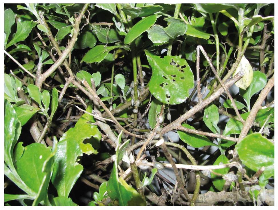
Fig. 3. Photograph at night of individuals of the isopod Tylos capensis climbing on stems and leaves of the bietou bush Chrysanthemoides monilifera rotundata along a walkway near The Promenade of Umhlanga beach, South Africa. Note the holes and cut-out margins of some of the leaves indicating feeding activity.

Tylos capensis exhibits an unusual behavior for a terrestrial isopod: it not only eats live leaves still connected to a plant (rather than dropped as litter), but also climbs up stems as high as 1 metre or more above the ground to reach them. Furthermore, it can