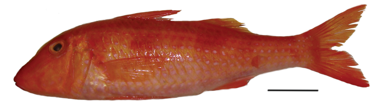
Figure 1 - The host Pseudupeneus maculatus, from the Coast of Pernambuco State, Northeast Brazil. Scale bar: 3 cm.

Regarding the levels of infestation, the present study found similar prevalence and intensities to those reported previously. The prevalence of the parasite found in this study was slightly higher than that reported by Luque et al. (2002), Cavalcanti et al. (2013), Hermida et al. (2014) and Carvalho-Souza et al. (2009) (Table I).