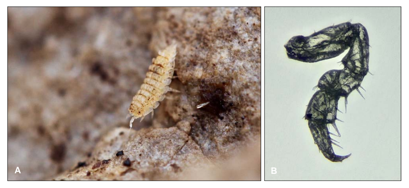
Figure 2: Haplophthalmus montivagus from Treborth Botanic Garden. A) In-situ Treborth Botanic Garden; B) Pereiopod vii of male (Coll. 1.xi.2019 T. Hughes).