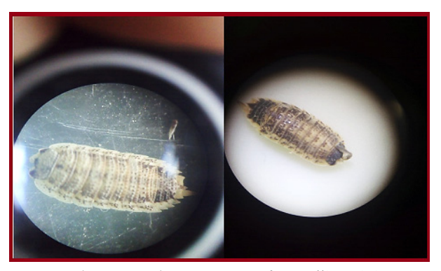
Fig. 3. The external appearance of Porcellio Spinicornis

This species differs from P. scarber in that it is brown