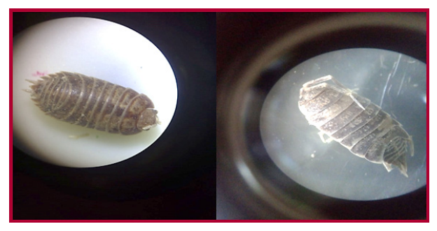
Fig. 1. The external appearance of the type Porcellio leavis

species is (40.8%), which is higher than the rest of the species recorded in the current study.