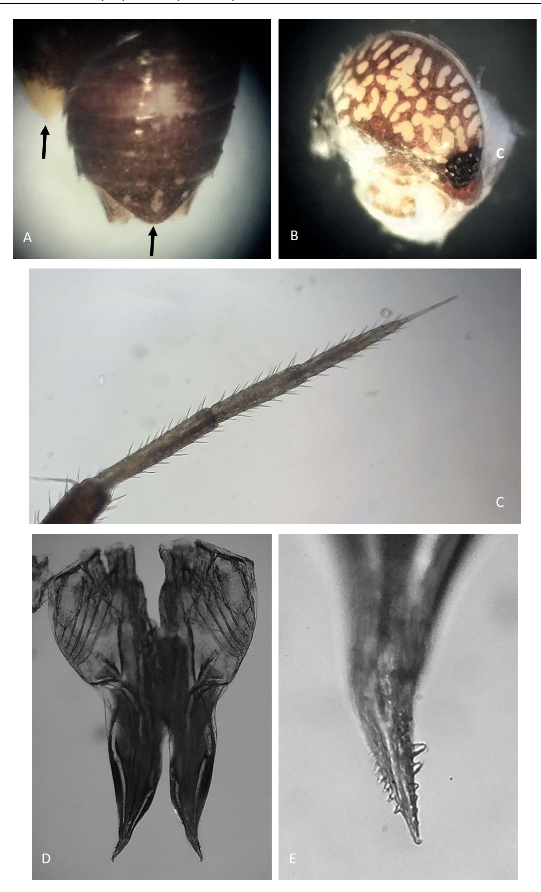
Figure 2: Chaetophiloscia cellaria from Guernsey.

A) Peon and telson (arrowed), and orange 'patch' on 7<sup>th</sup> pereionite (arrowed); B) Head and ommatidia; C) Antennal flagellum of three articles; D) Male 1<sup>st</sup> endopods; E) Male, tip 1<sup>st</sup> endopod.