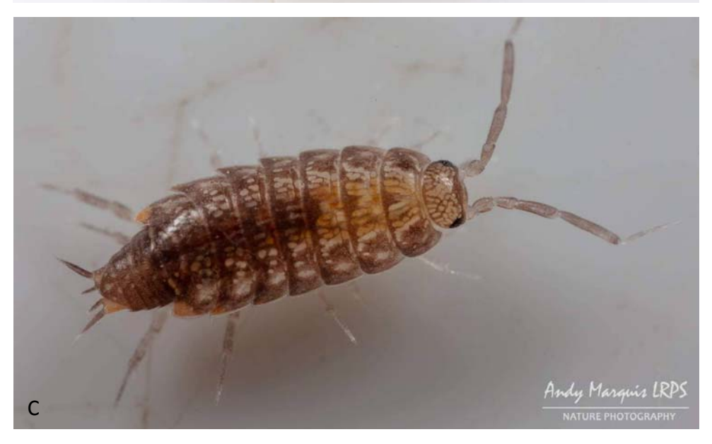
Figure 1: Chaetophiloscia cellaria , habitus of three specimens from Guernsey A) Specimen photographed May 2018; B) Female collected 17.ii.2019; C) Male collected 24.iii.2019.