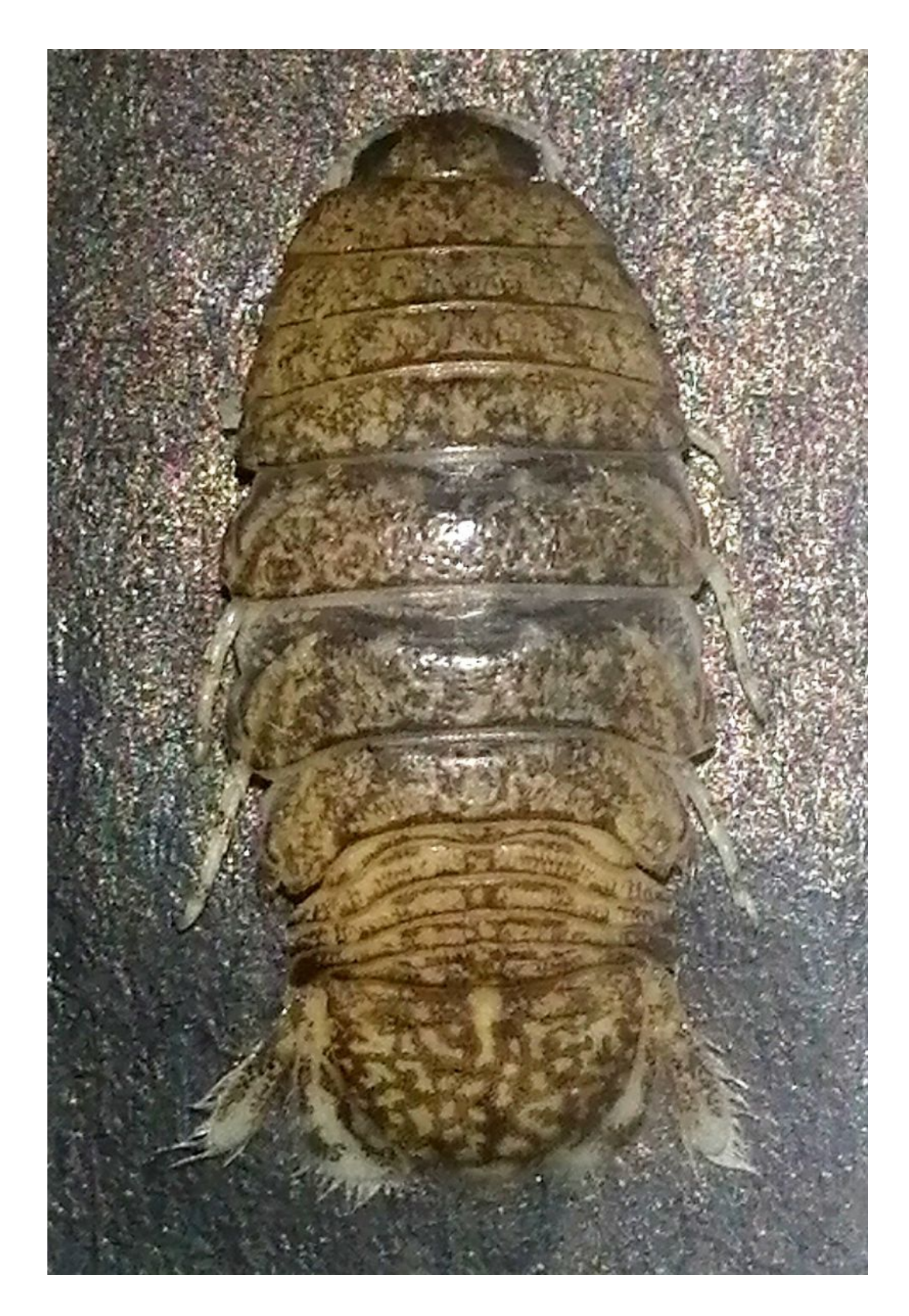
Figure 3 Alitropus typus female (dorsal view)