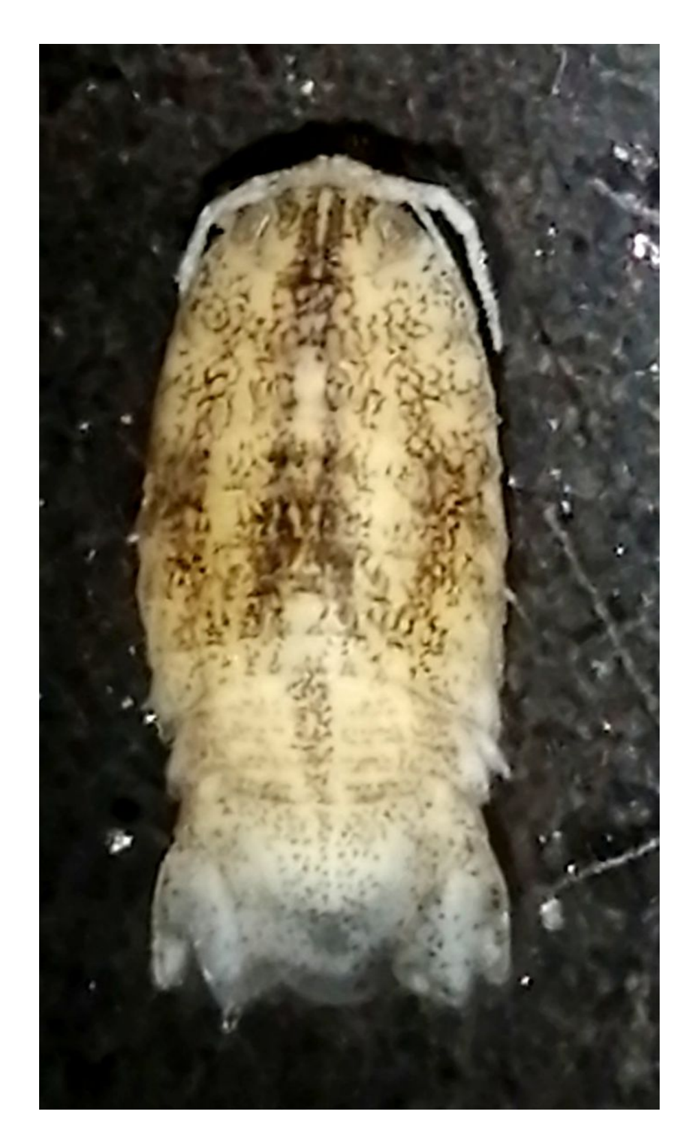
Figure 4 Alitropus typus male (dorsal view)