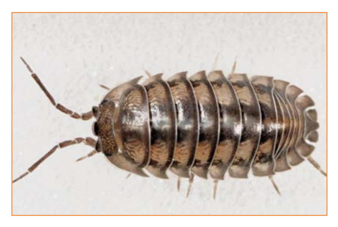
Figure 16.4 Pillbug, Armadillidium nasatum , a more recent introduction and the most abundant isopod in our garden. Specimen from our garden.