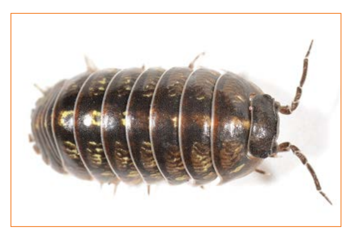
Figure 16.3 Pillbug, Armadillidium vulgare , introduced from Europe and common in this region by 1818. Specimen from our garden.

bution, living mostly in moist places, as under stones or logs, in crevices or rocks, about greenhouses, cellars, under boards, etc." He named four neighborhoods in Philadelphia where he collected it.<sup>6</sup> Now, almost two centuries after Thomas Say's paper on crustaceans, those he described are still here, and new ones have arrived and established themselves.