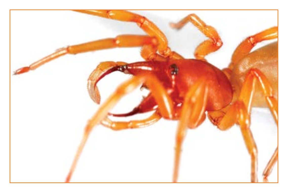
Figure 16.7 Pillbug hunter's formidably long fangs work like pincers. The top fang holds the victim and the bottom fang skewers it on the soft underside and injects the venom.