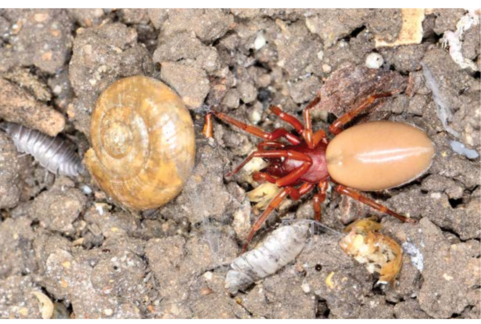
Figure 16.5 Pillbug hunter (Dysdera crocata) under a log in our garden. Remains of its victims are scattered about.

Aggregations of A. nasatum would appear to be easy targets for the European centipede ( Cryptops hortensis ) and the pillbug hunter Dysdera crocata , an introduced spider that specializes in preying on terrestrial isopods.<sup>42</sup> This spider has long fangs that it uses like pincers to seize isopods, which it secures with one pincer clamping down on the armored top and the other puncturing the soft underside,<sup>43</sup> which it injects with venom that can kill within seven seconds.<sup>44</sup> It hunts at night without use of a web to snare prey.<sup>45</sup>