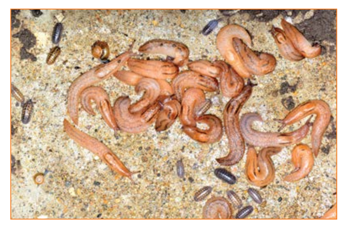
Figure 16.9 Threeband gardenslugs ( Lehmannia valentiana ), huddling under a paving stone. Huddling protects slugs from desiccation. (A recent synonym for its scientific name is Ambigolimax valentianus .)