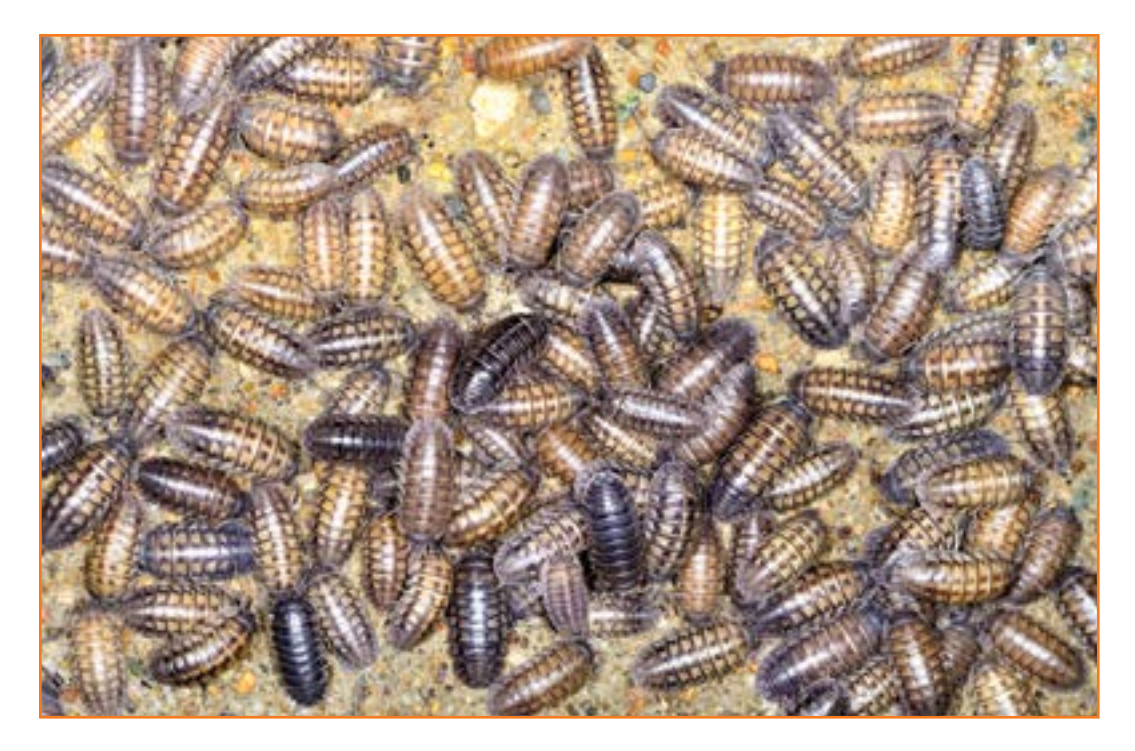
Figure 16.8 Bunching of pillbugs ( Armadillidium nasatum ) on the underside of a paving stone in our garden. Aggregation protects individuals from desiccation and predators. A genetic polymorphism contributes to differences in color among individuals.

Hamilton contended that even nongregarious species gain safety in numbers. In our garden his conclusion sheds light on pillbugs that happen to live outside of aggregations. Typical of territorial spiders<sup>52</sup> pillbug hunters in our garden space themselves apart and keep their population densities low. Searching in pillbug hunters' favorite shelters such as under logs, I usually find no pillbug hunters. When I do find one, it is solitary. In our garden, low densities of pillbug hunters and high densities of pillbugs keep ratios of pillbug hunters to pillbugs low; these low ratios also keep the odds of an attack on any individual pillbug, even those outside aggregations, low.