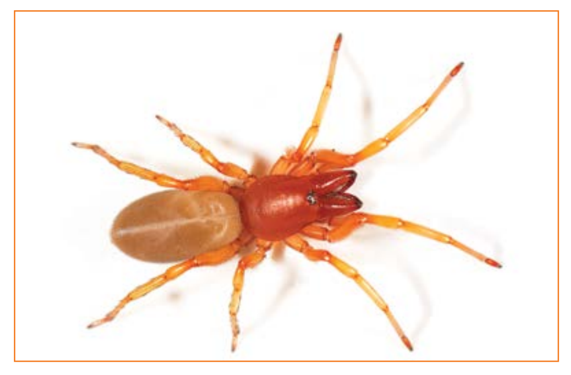
Figure 16.6 Pillbug hunter. I collected this individual in our garden.