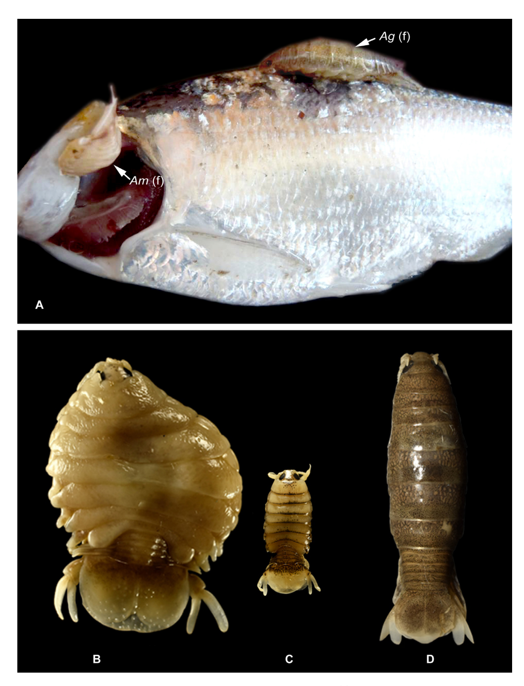
Figure 1. A , Co-infestation of external attaching Anilocra grandmaae [arrow Ag (f)] and branchial attaching Agarna malayi [arrow Am (f)] infesting an individual Tenualosa toli . B , C , Ovigerous female and male of Ag. malayi , respectively. D , Ovigerous female of An. grandmaae .

either side of the gill chamber (Fig. 1; Tab. 1). The specimens were photographed using a Leica M205A dissection microscope and image capturing software (Leica Application Suit). The prevalence (P) and mean intensity (I) were calculated according to Margolis et al. (1982) and Bush et al. (1997). Sources for fish taxonomy and host nomenclature were Fish Base (Froese and Pauly, 2021) and Catalogue of Fishes (Fricke et al., 2021).