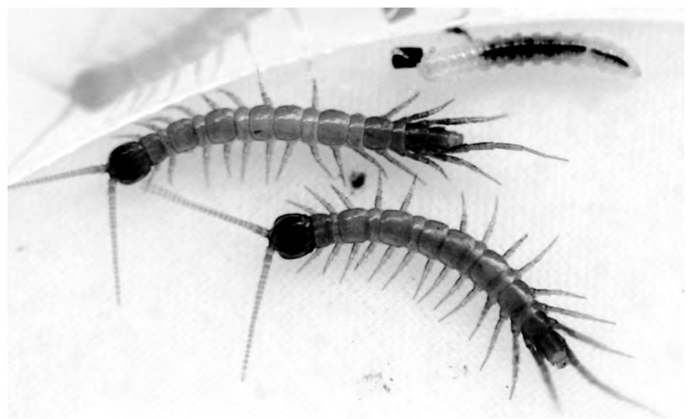
Figure 2. Adults of the centipede Lamyctinus coeculus with an early instar of the millipede Oxidus gracilis in the upper right corner.