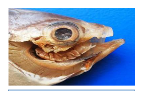
Fig 2. Norileca indica Milne-Edwards, 1840 inside the buccal cavity of Rastrelliger kanagurta (Cuvier, 1816).