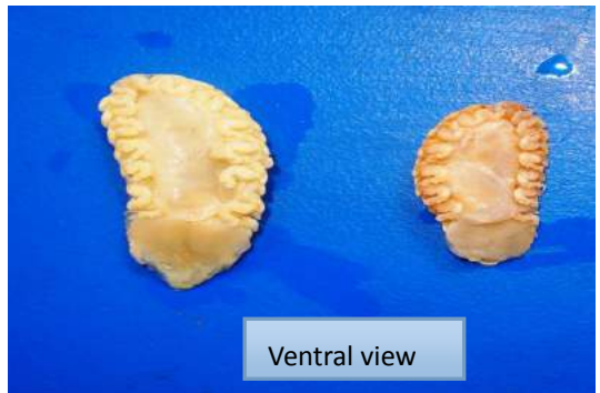
Fig 1. Norileca indica Milne-Edwards, 1840.