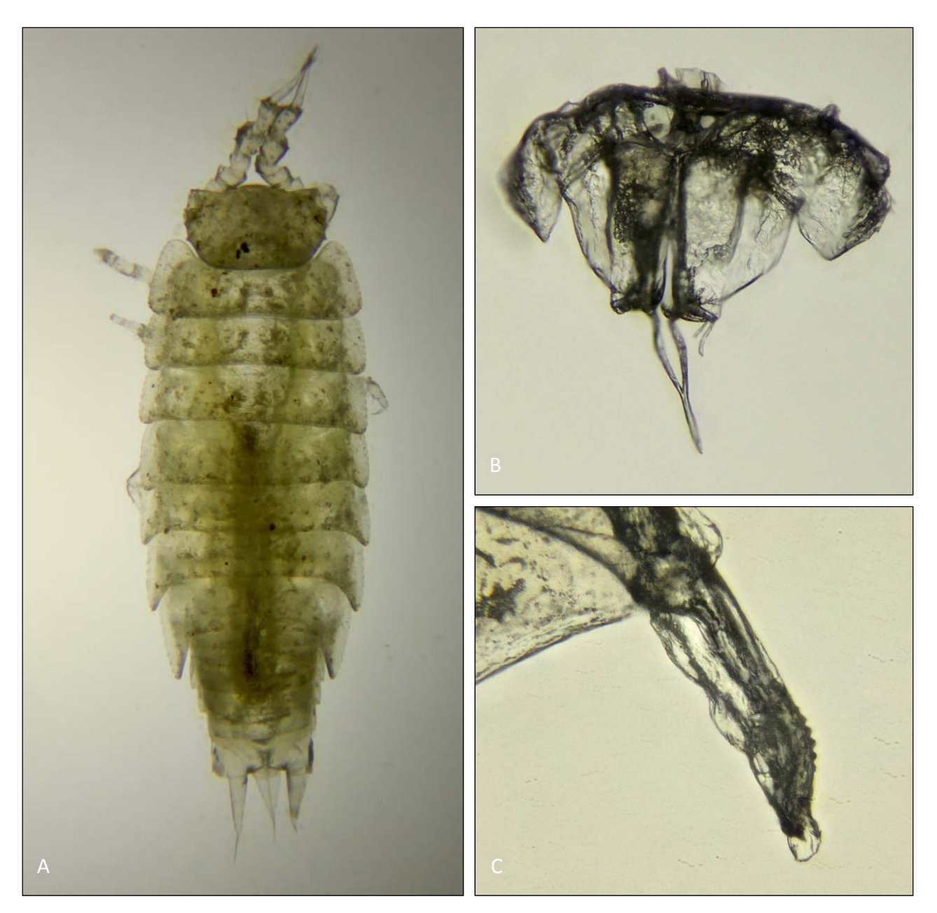
Figure 1: Male Metatrichoniscoides leydigii from the Ribble Estuary, Preston Docks, Ashton, Lancashire. A) Habitus, dorsal view; B) Pleopod 1; C) Distal process of the Endopodite 2

The Ribble Estuary also reflects a similar industrial past to the River Medway. The sampling location is in close proximity to Preston Dockland (previously, one of the largest single docks in Europe). The construction of the docks required a major remodelling and diversion of the river channel, with many of the riverbanks being artificially laid with stone. Following its completion in 1892, the docks had a 90-year industrial lifespan, being heavily involved in the importation of cotton, coal, timber, wood pulp, china clay, fruits, oil etc. from all over the world (Davies, 2019). The available literature failed to make any clear links with countries within the range of M. leydigii , but the likelihood of vessels moving between these countries and Preston Docks is still exceptionally high. This evidence greatly diminishes the probability of this being a native population of M. leydigii , but it does suggest a much broader distribution for them around the British coastline, especially along semi-natural and industrially-disturbed estuarine habitats.