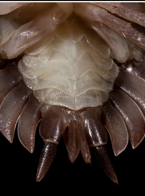
tail appendages and gills