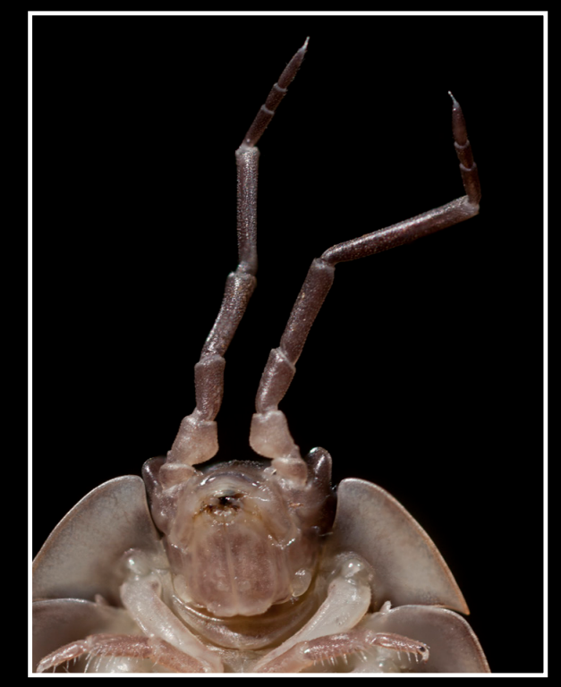
head and main pair of antennae

Woodlice are a member of the class Crustacea, which also includes aquatic species such as lobsters and crabs. Because of their origins from the water, they prefer moist environments and are commonly found under fallen logs and leaves in damp forested areas. Woodlice have gills on the underside of their abdomen where gas exchange occurs.