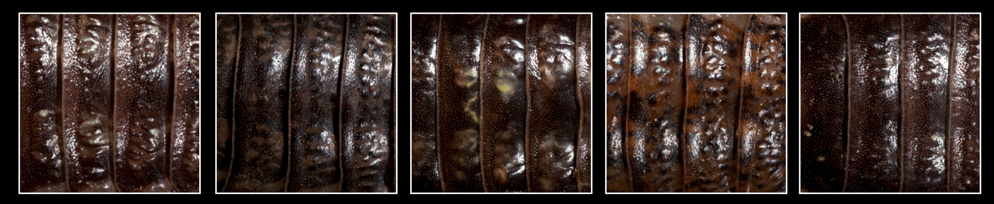
multiple patterns, colors, and textures throughout different specimens