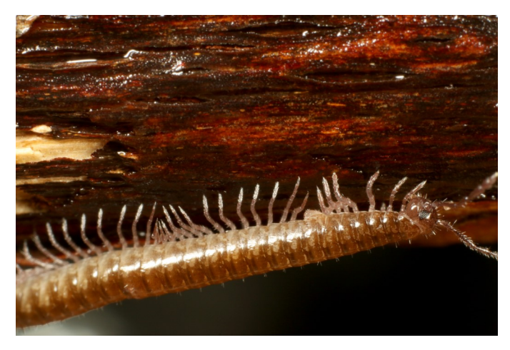
Chordeuma proximum