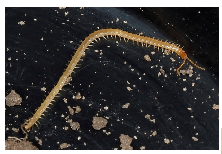
Geophilus proximus

consequence of this, Geophilus impressus C.L.Koch, 1847 is to be regarded as the correct name – and the atlas amended accordingly.