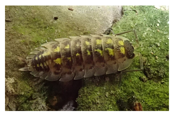
Porcellio spinicornis, collected for the DToL (Duncan Sivell)