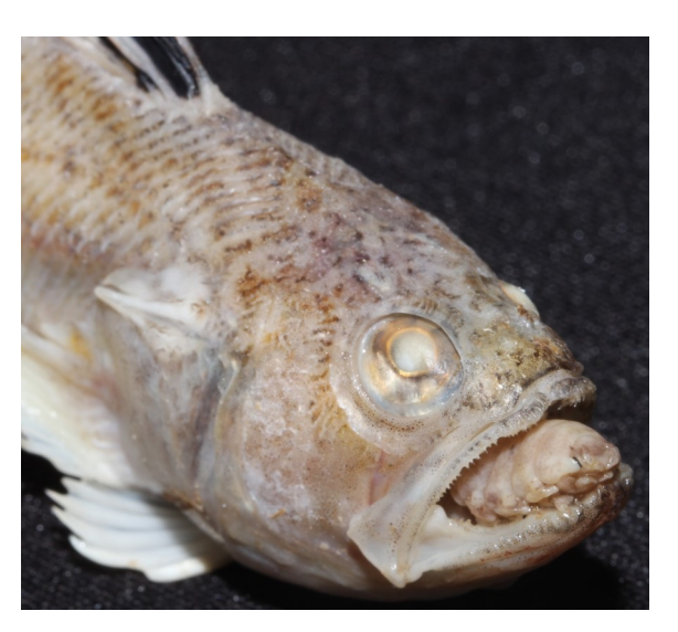
Ceratothoa steindachneri