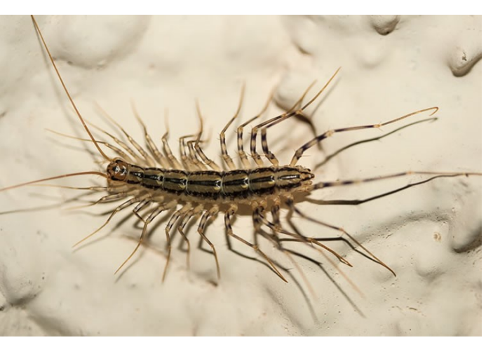
Scutigera coleoptrata (Nigel Partridge)