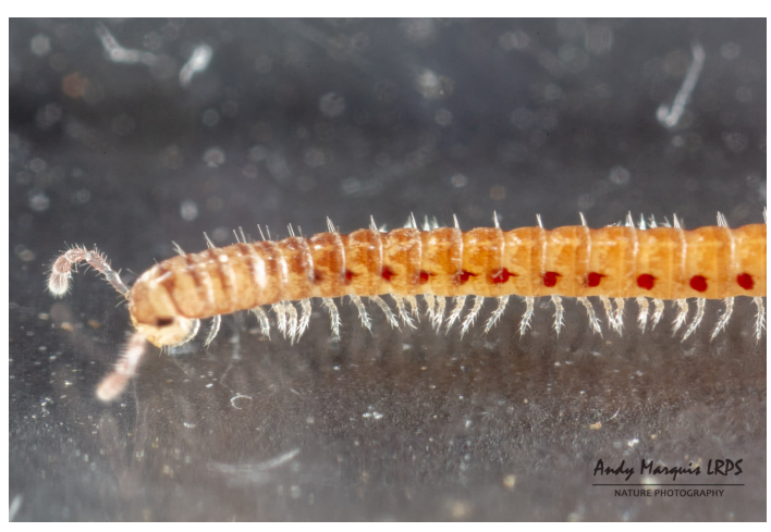
Thalassisobates littoralis