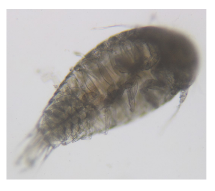
Clypeoniscus hanseni (Warren Maguire)

A single male was detected between the second pair of pereopods on the underside of an adult female I. balthica collected amongst red seaweeds at low tide. This species has been known to occur around the coasts of Britain for many years, but it is very poorly recorded, probably as a result of the small size of the male (which has a typical isopod shape) and the nature of the female (which is a sac-like internal parasite with no usual isopod characteristics). It is not included in Naylor (1972), in Naylor & Brandt (2015), or in Hayward & Ryland (2017). The species has been previously found in the Firth of Forth, at Cullercoats, in Dorset and around the Isle of Man (see <a href="https://www.bmig.org.uk/species/">https://www.bmig.org.uk/species/</a> Clypeoniscus-hanseni for references), so its occurrence in Berwickshire is not unexpected. Indeed it is likely to be widespread but overlooked due to its size and habit. Recorders should take care to examine host species for signs of it so that we can build a better picture of its distribution around Britain and Ireland.