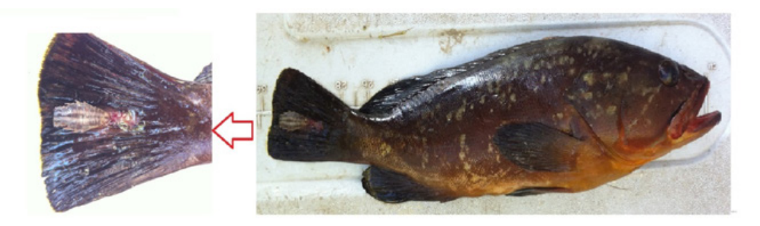
Figure 2. Nerocila bivittata on the caudal fin of Ephinephelus marginatus and hemorrhagic lession.