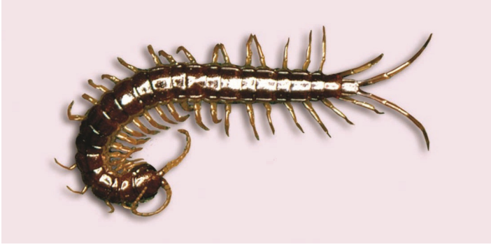
Figure 3. Centipede.

Centipedes (Figure 3) are many-legged animals (ranging from 10 to 100 depending on species) and belong to a group of animals called chilopods. They are usually brownish, flattened animals with many body segments, with most body segments having one pair of legs. Centipedes are fast runners and may vary in length from 1 to 6 inches. They have one pair of antennae, or "feelers," that are easily seen. Centipedes have poorly developed eyes and are most active at night. They are active predators feeding mainly on insects and spiders. All centipedes have venom glands to immobilize their prey, but the toxicity of the venom is not enough to be lethal to humans. The jaws of the smaller local species cannot penetrate human skin; however, the larger species may inflict painful bites.