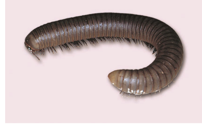
Figure 4. Millipede.

developed areas, where decaying vegetation provides excellent food and breeding conditions.