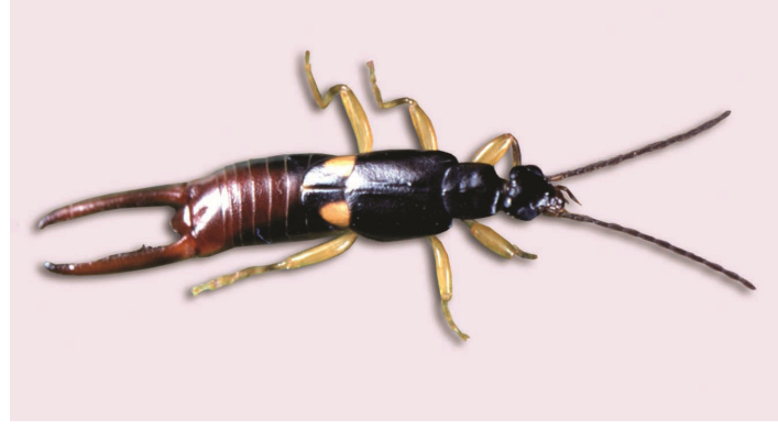
Figure 5. Earwig.

Earwigs (Figure 5) are elongated, beetle-like insects. They are short-winged and fast-moving and typically measure about 1/2 to 1 inch in length. They are usually dark brown and possess a pair of pincerlike appendages at the tip of the abdomen. They have chewing-type mouthparts and slow development.