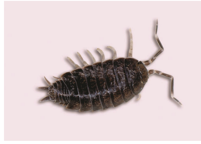
Figure 2. Sowbug.

Pillbugs, or "rolly-pollies," lack tail-like appendages and can roll into a tight ball, from which the name "rolly-pollies" is derived. Sowbugs, often called woodlice, possess two tail-like appendages, seven pairs of legs, and well developed eyes. They are incapable of rolling into a tight ball.